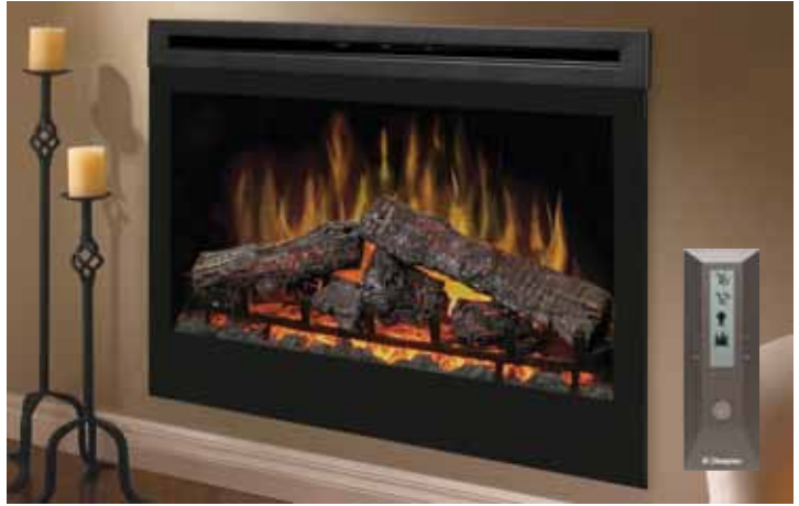
DF3033ST plug-in/direct wire firebox