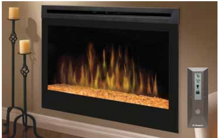
DFG3033 plug-in/direct wire firebox